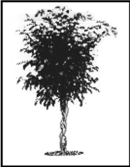
Weeping Fig Braided Ficus benjamina

___ Ficus ___ Philodendron ___ Palm ___ Dracaena