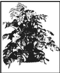
Split-leaf Philodendron Monstera deliciosa